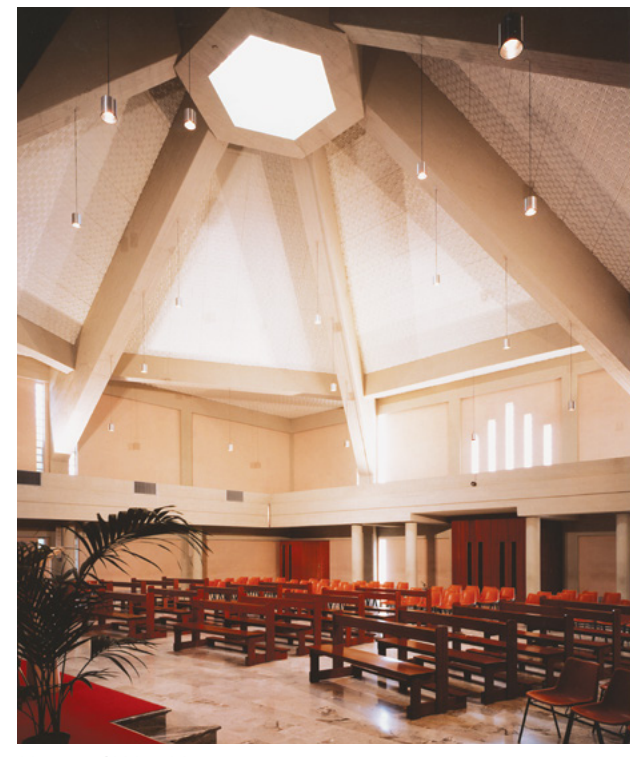
House of Worship SONEX® Panels

Installing acoustic products helps improve the worship experience, and pinta's panels and baffles enhance the aesthetics of any worship space.