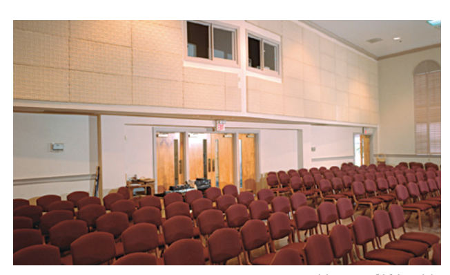
House of Worship SONEX® Valueline Panels

+1 (612) 355-4200 1-800-662-0032 sales@pinta-acoustic.com pinta-acoustic.com