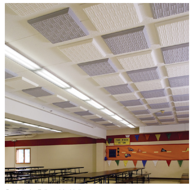
St. John's, Fellowship Hall SONEX® Valueline Panels