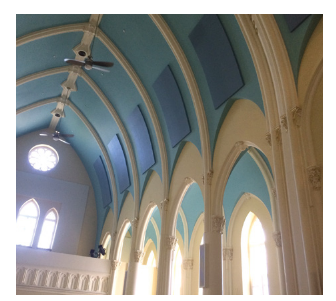
House of Worship WILLTEC Flat Sheets