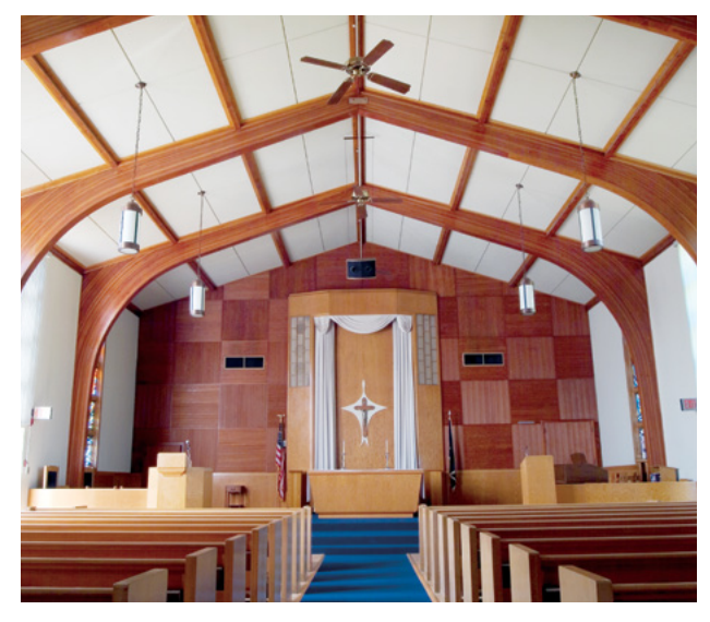
Chapel WILLTEC™ Flat Sheets