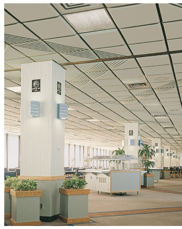
Parish Center CONTOUR Ceiling Tiles